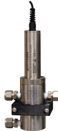
Being Installed in an AAI Flow Cell Apparatus