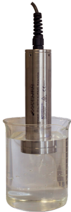
Being Directly Suspended in a Medium

The sensor can be directly suspended in a medium or installed in an AAI flow cell apparatus.